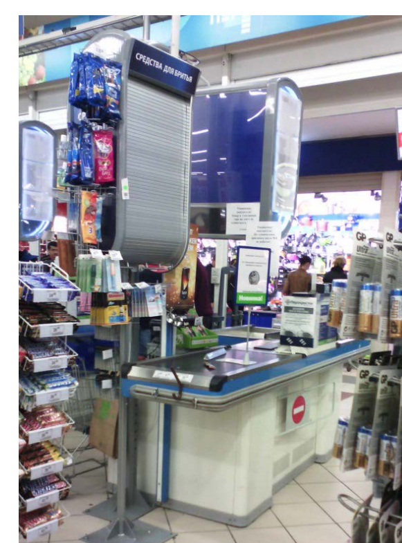
Figure 3: Cashier zone in Wave 2 - tobacco products covered