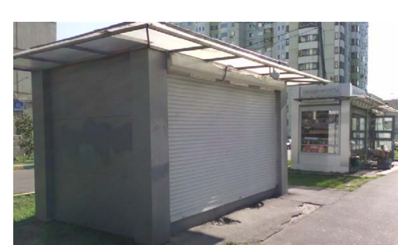
Figure 5: Kiosk in Wave 2 - Closed