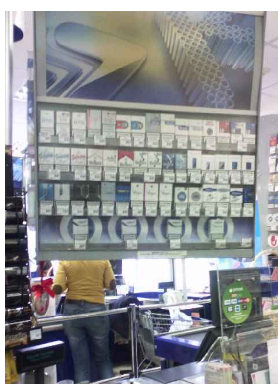
Figure 2: Cashier zone in Wave 1 - tobacco products visible