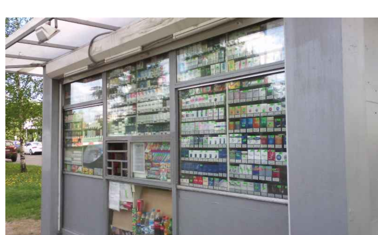
Figure 4: Kiosk in Wave 1 - Displaying primarily tobacco products