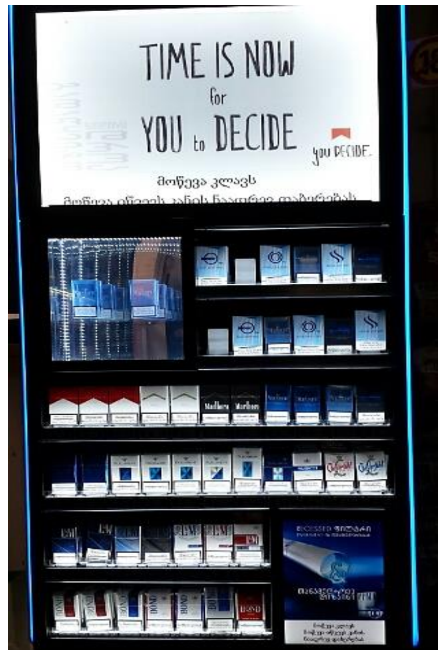
POS display using lights, Tblisi, Georgia