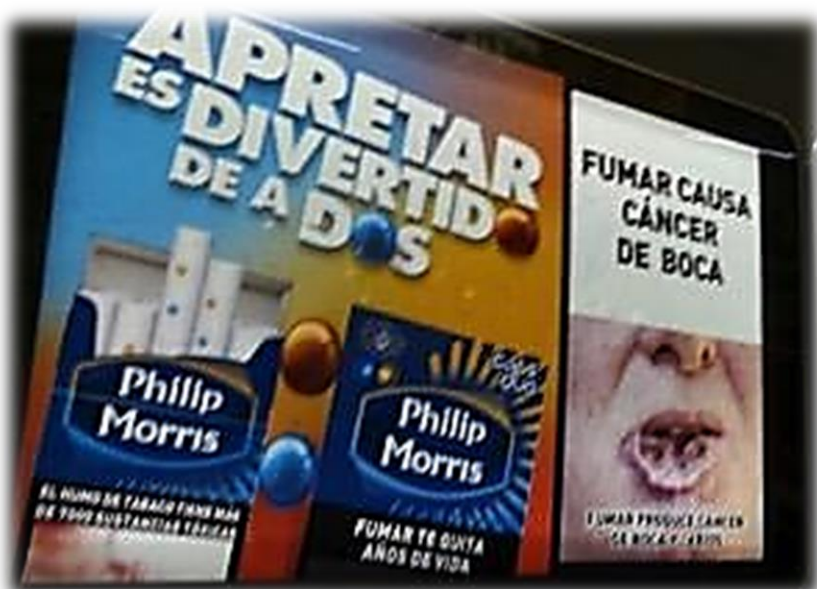
POS advertising signage, Buenos Aires, Argentina