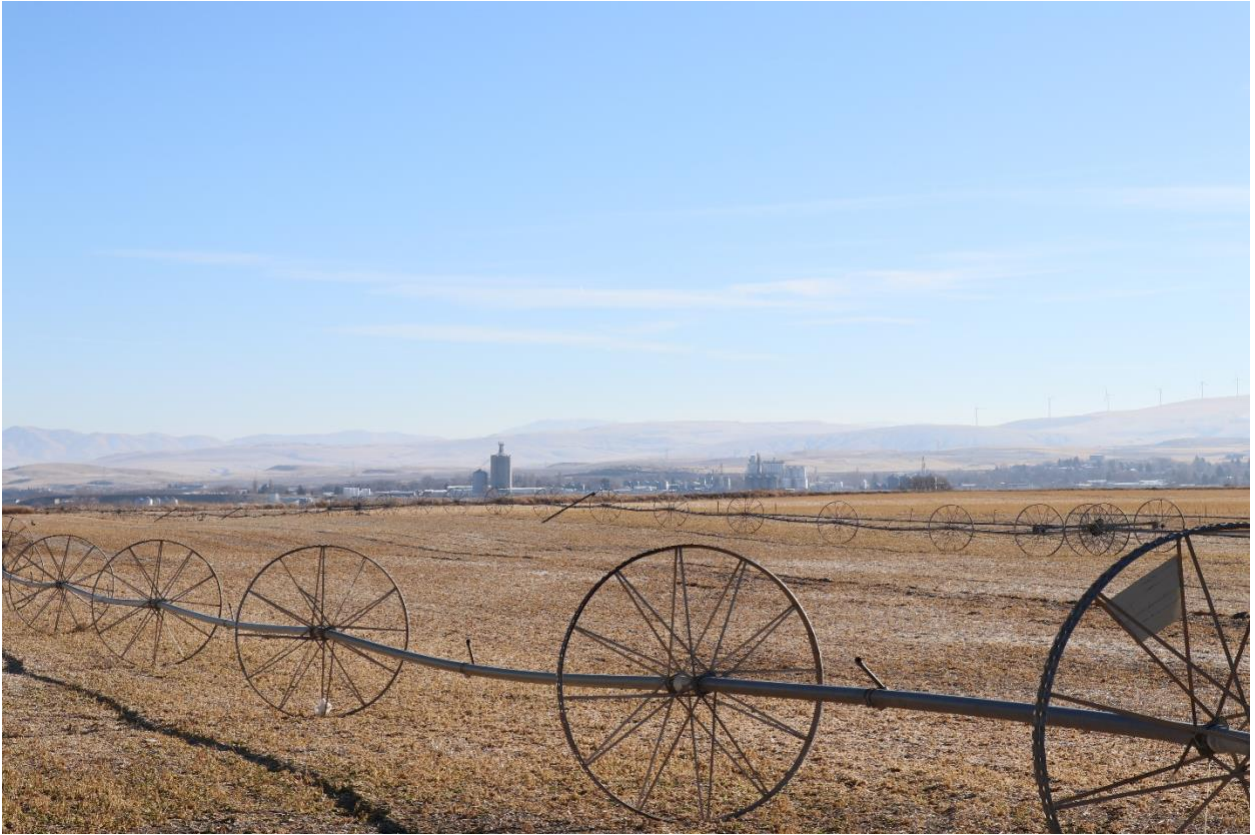
Figure 1. American Falls, Aberdeen area: southeastern Idaho.