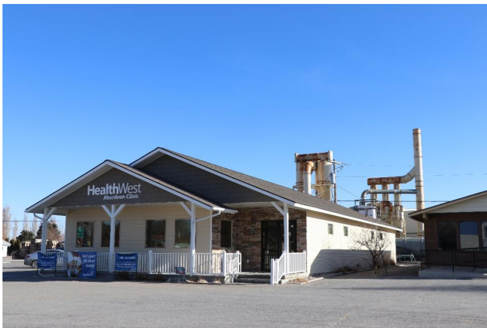
Figure 2. Health West medical clinic, Aberdeen, Idaho.

SIPH is structured for civic engagement by having county commissioners serve on their board, this can cause friction due to commissioner's different levels of healthcare knowledge. Even with their tireless work and dedication, public health services and employees in all of Idaho are under threat. Effective March 1, 2022, "the state will no longer be required to provide state funded support to the health districts." 17