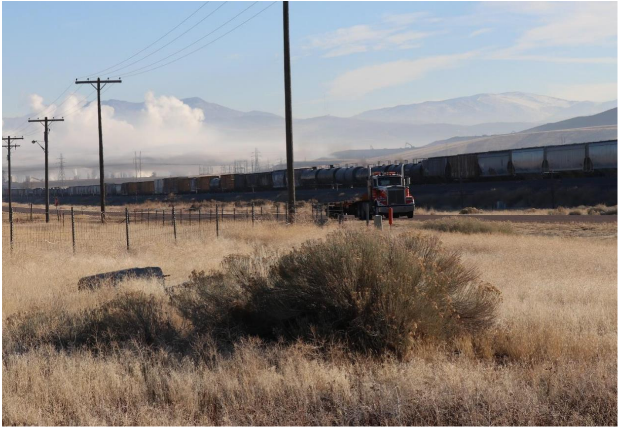
Figure 3. Power County train.