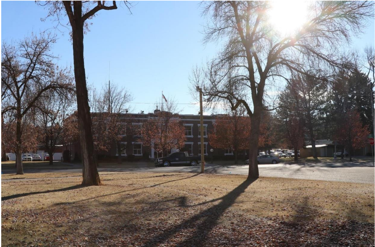
Figure 4. Power County Courthouse.

This section introduces 3 localized recommendations and actions that complement CommuniVax’s national recommendations listed in Appendix A. These local recommendations target the interconnectivity of individuals, communities, healthcare providers, and state and federal level institutions; these levels operate in tandem. Addressing issues at all levels will provide better outcomes in relation to vaccination rates plus overall health status of Idahoans. Such an approach allows for more opportunity to address the social determinants of health that exist at all levels. 16